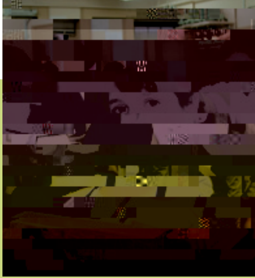
LEAGUE ; 7-