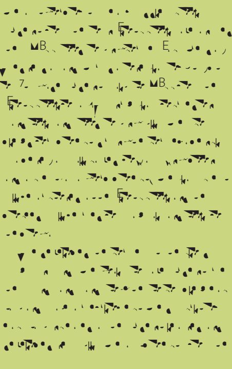
B... 08, L... t...